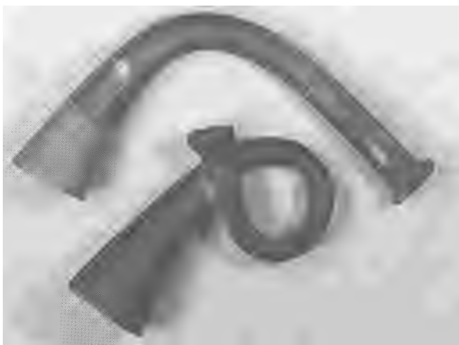
Figure 2 Clay trumpet and horn

century. 8 It is also known that a glass factory at Montceau near Fontainebleau functioned briefly from 1640 to 1643. 9