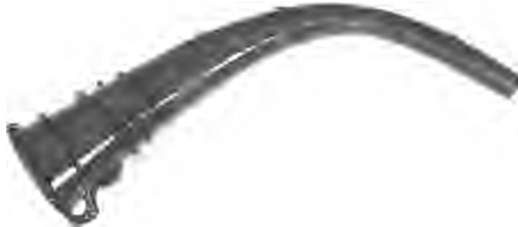
Figure 1 Trumpet of red glass

Eugene Thoison had already taken great interest in the origins and characteristics of these instruments. 6 They most frequently present the profile of a hunting instrument with a more or less pronounced curve; a few of the fragments show, instead, the form of a hunting horn. The surface of the instruments is sometimes smooth, sometimes corrugated. Some have been decorated with a glass paste thread that coils around the piece.