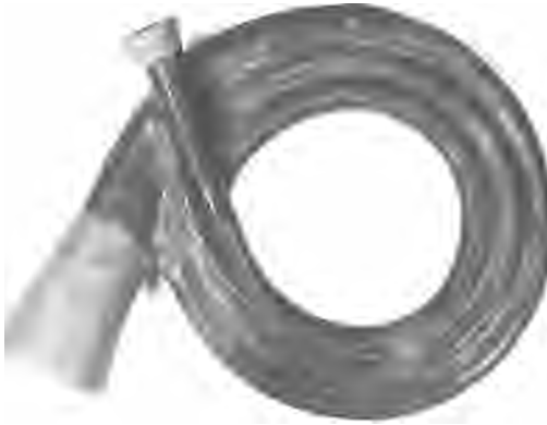
Figure 4 Triple-spiral clay horn