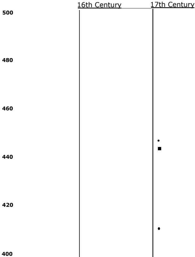
Graph 2 Mute Cornett Pitches

mezo punto —and strumenti coristi or instruments at corista ) may explain why certain instruments like Renaissance flutes (whose surviving pitches are mostly at A-405) 50 and mute cornetts were normally pitched lower than curved cornetts, violins, and other "treble" instruments. Weber wrote that "Transverse flutes and mute cornetts are... those wind instruments which appear together with strings in the so-called ' Still ' or 'Broken' Consort." 51