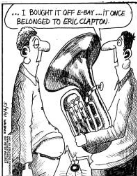
By permission of Peter Waldner and Creators Syndicate, Inc.