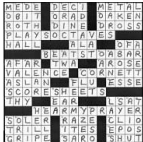
Last Issue's Answers

Got something fun to submit? Send your puzzle, joke, or historically humorous story to president@historicbrass.org