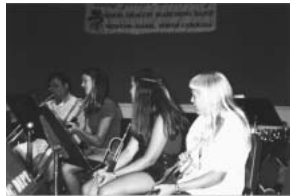
"You mean you actually prefer these things?"