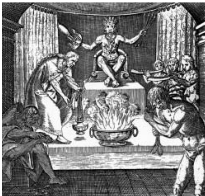
How Indian priests do penance for the sins of the people

This illustration is from the ninth volume of the series, published in 1600, and supposedly based on descriptions of the Dutch explorer Jan Huygen van Linschoten's journeys. The text however is actually from Historia Natural (Sevilla, 1590) by the Jesuit priest José de Acosta (1539-1600), who was active in Peru and Mexico from 1571 to 1588. Both the text and engraving explicitly verify that the cornett was played by Central American natives. Because of its close connection with religious observances, cornett playing was apparently stamped out during the forced conversion to Catholicism. The